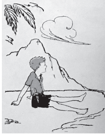
Fig. 2. Peter Pan on Never-Never Land beach, p. 3.

Gazette , 19 Nov, 1926), information that helped in the initial dating of the pamphlet. Its print run was almost certainly limited to the low hundreds, perhaps even less. Copies were only available by ‘Application to the Secretary of the Fund’.