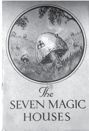
Fig. 1. Front cover attributed to Mabel Lucie Attwell

activities such as mannequin parades, house sales, and special theatrical performances in London. Royal and aristocratic patronage including the support of HRH Princess Mary of Teck, and the Duchess of Norfolk, ensured regular publicity in national newspapers.