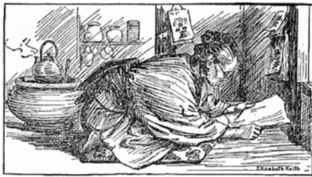
Fig. 1. 'Our Japanese Maid', TJS , No. 2 (3 June, 1916)