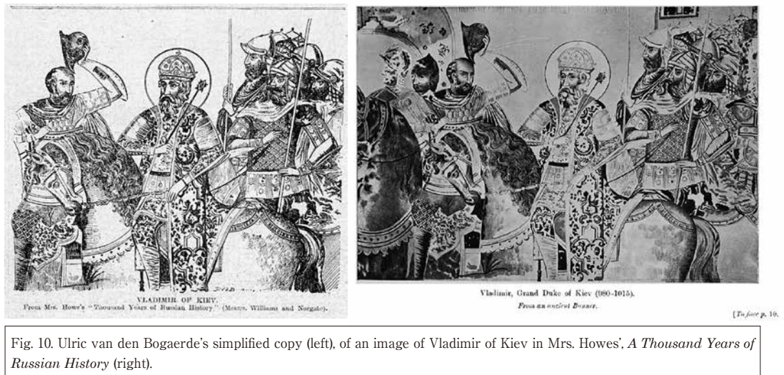
Fig. 10. Ulric van den Bogaerde's simplified copy (left), of an image of Vladimir of Kiev in Mrs. Howes', A Thousand Years of Russian History (right).

History (Fig. 10); Russian porcelain statuettes of peasants copied from items in the Franks Collection. The close fidelity, but flatness and lack of liveliness of the copyist is evident here, but more importantly, the contrasting compositional methods point to the balance of power between the three nations. Nevertheless, the strongly derivative nature of his work did not preclude the creation of powerful images. His 'Archangel: An Ice-breaker at Work' (Fig. 8), which served as the cover illustration for the 15 January 1916 issue, is a good example.