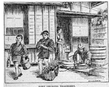
Fig. 2. 'Some Obliging Tradesmen', TJS , No. 2 (3 June, 1916)

Yet, in general, Keith's written account of setting up home in Japan suggests an initial reaction to Japanese domestic culture that was more conventional and clichéd than it was instinctively sympathetic. In her rejection of the porcelain of 'garish modern colour imported with other ugly things from the West', 7 for example, she is guilty of the aesthetic and cultural self-loathing which, far from an abrogation of the 'Western Eye', had become a common affirmation of it. A rich vein of such sentiment runs through the encounters with Japan that a clutch of English poets and artists had from the beginning of the Meiji Restoration, well into the twentieth century, but perhaps more deeply in America where the embrace of Japan's visual culture belied a political and racial sense of superiority under conditions in which both the West and East were trading cultural fictions. Keith's identification with the 'Foreigner's voice' in her writing, epitomising the simplistic East/West dichotomy, strikes one as peculiarly at