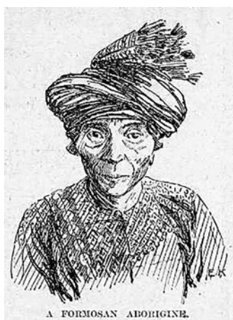
Fig. 6. 'A Formosan Aborigine', by E. Keith, TJS , No. 6 (16 December 1916)