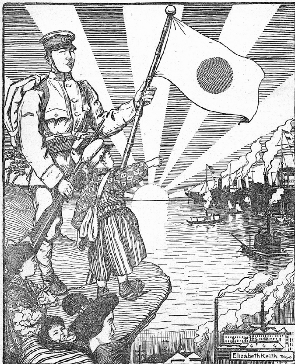
THE NEW JAPAN.