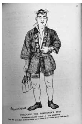
Fig. 3. 'Through the Foreigner's Eyes', The New East (1917).

odds with the openness and humanity of her sketches, which in their graphic simplicity and depiction of everyday life, exhibit the intimacy that dissolves the boundary between the artist and her subject. Nevertheless, her willingness to accept the 'observer status' of the foreigner was reinforced a year later in a short series of illustrations for her brother-in-law's periodical The New East . In direct contradiction of M. C. Salaman's assertion that Keith never felt her foreignness when travelling through Japan, this series was titled, 'Through the Foreigner's Eyes' (Fig. 3.), and appeared in juxtaposition to a sister series, 'Through Japanese Eyes', produced by an uncredited Japanese artist.